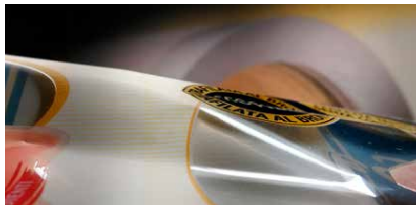
Textured surface sample product using ART™ Gold engravings