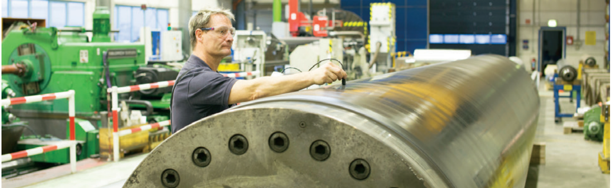
Tungsten carbide coating lasts 3 times longer than chrome plating on calender rolls