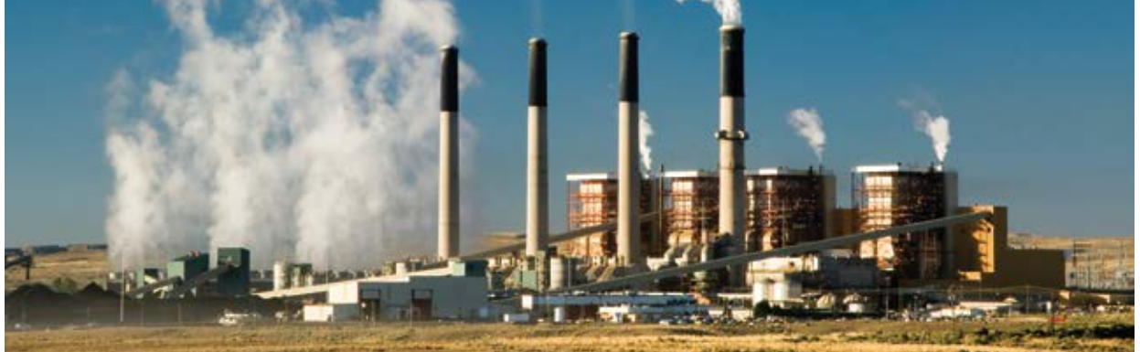
Solid particle erosion can be a big problem for coal-powered, steam-driven generators